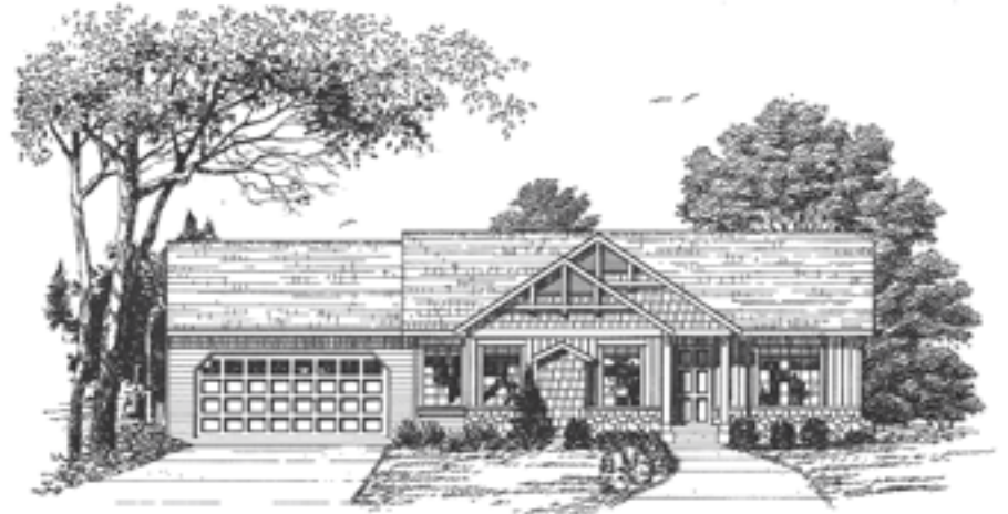
2 additional exterior styles available