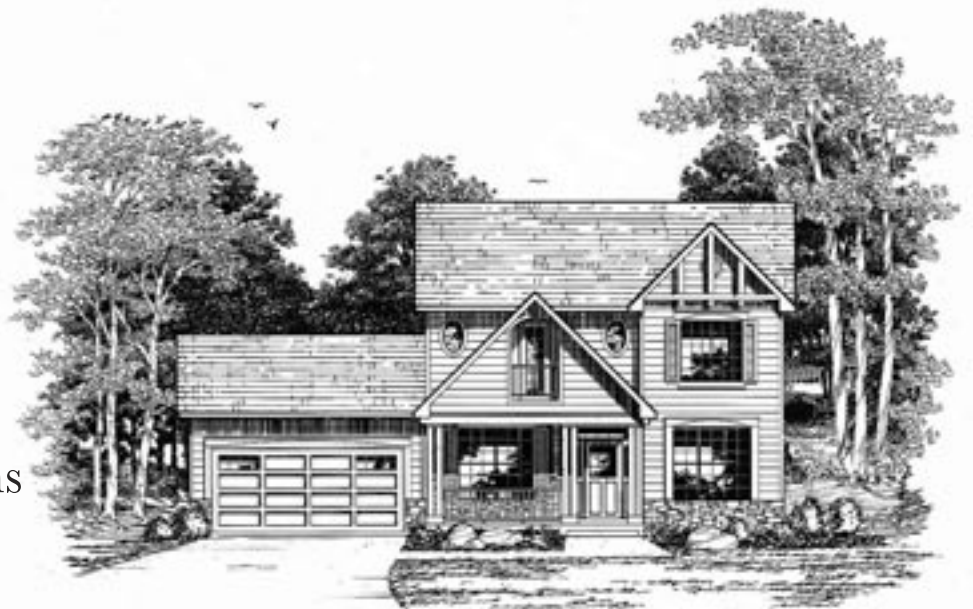
1 additional exterior style available